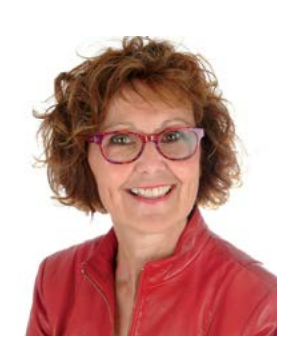
Member for Repentigny and Second Opposition Group Critic for Families and Anti-Bullying

With this concerted action plan to prevent and counter bullying, Québec is giving itself an important tool to face this growing problem—one that has ramifications on all spheres of society. This plan is the result of a thorough consultation with members of the National Assembly, the various government departments concerned, and stakeholders working in the field. Its success will depend on the efforts made by all Quebecers. My party is proud to have participated in the preparation of this plan to ensure that the most vulnerable among us can live in a more respectful and just Québec.