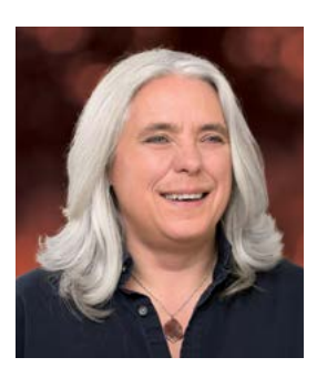
Member for Sainte-Marie-Saint-Jacques

Bullying is a disturbing phenomenon. The behaviour of some members of our society makes us realize that bullying is a scourge and that it's urgent we intervene to thwart the harmful effects these misdeeds can have on the public. As such, I am pleased to have collaborated on the 2015-2018 concerted action plan against bullying, which coordinates efforts and offers concrete measures to fight bullying. This is an important step to eliminate it and ensure the harmonious development of Québec society in the long term.